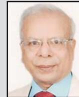
Dr. Ishrat Husain Dean & Director IBA