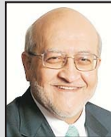
Hussain Dawood Chairman Karachi Education Initiative and Dawood Group