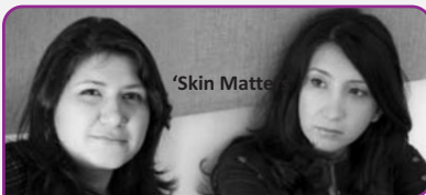
Zeb & Haniya Band

She is a member of the British Cosmetic Dermatology Group, Pakistan Association of Dermatology and ESCAD (European Society of Cosmetic & Aesthetic Dermatology). She is appointed by the President as an Advisor / Consultant in the Federal Ministry of Health.