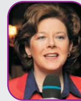
Moderator: Eithne Treanor Special Correspondent CNBC