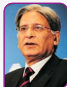
Chaudhry Aitzaz Ahsan* Barrister-at-Law and Senior Advocate at the Supreme Court of Pakistan

Chaudhry Aitzaz Ahsan (born on September 27, 1945, Murree, Islamabad Pakistan) is a Barrister-at-Law by profession and a senior advocate at the Supreme Court of Pakistan. He is also a writer, human rights activist, politician, former Federal Minister for Law and Justice, Interior, Narcotics Control (1988-1990) and Education. Elected to the Senate of Pakistan in 1994, he eventually succeeded as the leader of the House and the leader of the Opposition between the years 1996 and 1999. Currently he is president of the Supreme Court Bar Association. Aitzaz Ahsan comes from a family background steeped in politics. He received his early education from Aitchison College and the Government College, Lahore. Later he studied law at Cambridge University, UK and was called to the bar at Grays' Inn in 1967.