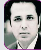
Syed Talat Hussain Senior Journalist