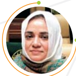
RABIA AZFAR NIZAMI Member of the Provincial Assembly of Sindh