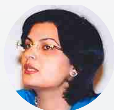
Sania Nishtar SI, FRCP, Ph.D

Senior Vice President Abraaj Capital - UAE