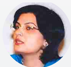
Sania Nishtar SI, FRCP, Ph.D

Senior Vice President Abraaj Capital - UAE